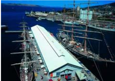
Hobart Function & Conference Centre - 1 Elizabeth St, Hobart