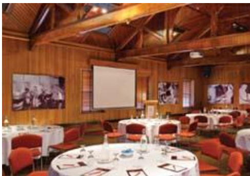
Henry Jones Art Hotel - 25 Hunter St, Hobart